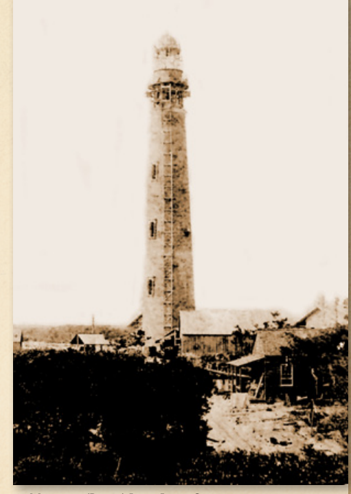
Mosquito (Ponce) Inlet Light Station was under construction at the time of the quake

from stationary cupboards, and toilet bottles, etc., from bureaus." (Note: the 'old Spanish fort' was actually a fortification built by the US government in 1815 using a British style derived from a 1565 defensive tower built at Mortella Point on the Island of Corsica. The British called their short, round, and thick-walled towers Martellos. These were usually constructed of stone or brick, but the one at Tybee was tabby and wood. It is no longer standing.) The damage at the Tybee main light was enough to cause the keeper to request the services of the Sixth District's lampist as the lens had shifted off the center of its pedestal. John Johnson, keeper of the range lights at Tybee Knoll Cut, reported another aftershock on September 6th.