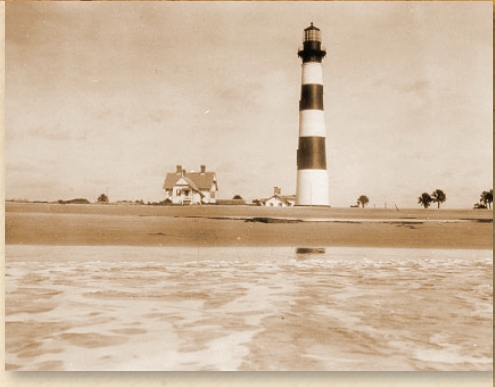
CHARLESTON MAIN LIGHT

At Tybee Island, the earthquake extended some existing cracks in the tower and made some new ones but these cracks were not deemed to be dangerous. The lens was displaced by the quake and the attachments to its upper ring were broken. The lens was repaired immediately, although in a letter of September 3 to James Gregory, assistant