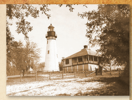
Amelia Island Lighthouse, Florida

crack occurred. It moved the lens, which weighs about one ton, 1 ½ inches to the northeast. It shook the signal office building, which is 35 feet high with a wall of concrete 10 feet thick, in the old Spanish fort, known as the Martello tower, sufficiently to throw crockery, etc.,