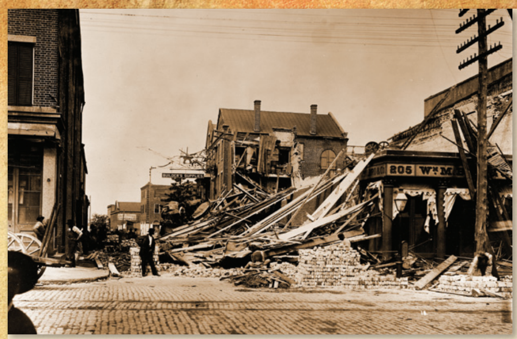
ALL BUILDINGS IN CHARLESTON WERE DAMAGED AND MANY WERE DESTROYED